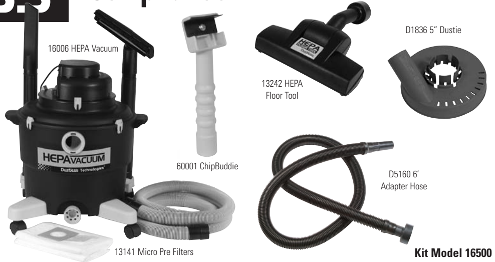
Kit Model 16500