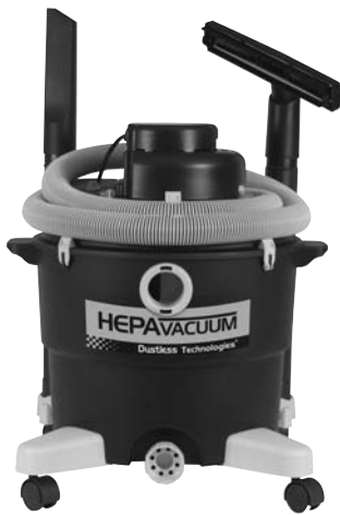
HEPA Vacuum - Complete owners manual enclosed with vacuum.

Assembly - To install the legs and accessory tray, undo the clips holding the intermediate cover in place and set the cover and lid assembly aside. Turn tank upside down. Front legs are on either side of the drain port opening. These front legs do not have the small hooks on either side. The back legs do have the hooks. These hooks are for the hose to rest on when in storage.