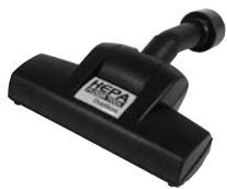
HEPA Floor Tool - The HEPA Floor Tool features a beater bar as specified by EPA to meet renovation contractor certification requirements. Fit easily into HEPA Vacuum attachments.

Push hose into tank port; twist hose to tighten or loosen connection. The wands and cleaning accessories attach to hose in the same manner.