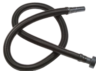
Adapter Hose - Attaches easily to HEPA Vacuum hose.